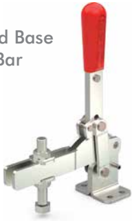
229 Flanged Base Open Bar